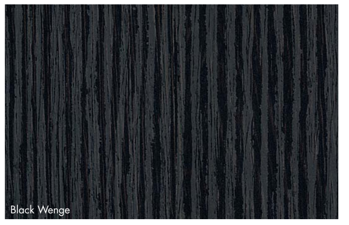
9mm MDF available in 2700 x 1200mm.

18mm MR-MDF available in 2400 x 1200mm, and 3115 x 1200mm.