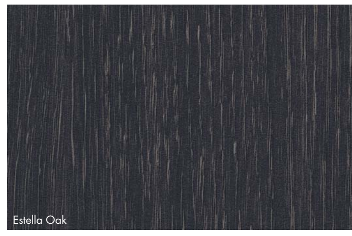
9mm MDF available in 2700 x 1200mm.

16mm MR-MDF available in 3115 \times 1200mm, and 2400 \times 1200mm in select colours.